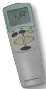
Includes a fully featured wireless remote per indoor unit.

True zone control is possible because each air handler operates independently. InverterFlex systems are also great for larger spaces such as fellowship halls and commons areas: install one or more units for quiet, efficient, easily controlled comfort.