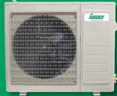
Includes a fully featured wireless remote Outdoor Unit